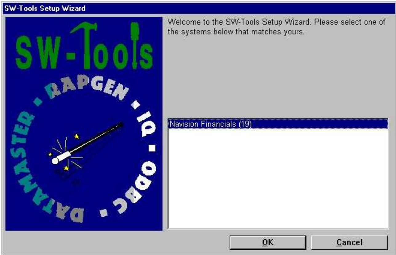
1. Selecting the Navision Financials/Attain interface

You need to select the following interface as shown in this figure: